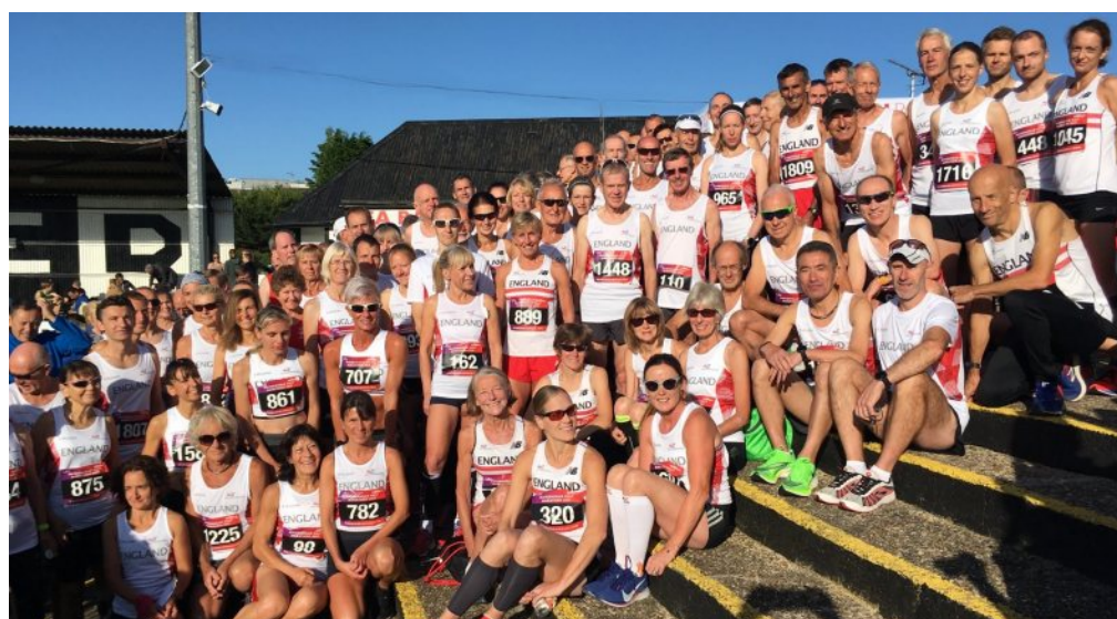
England team prior to the race assembling on the terracing of Maidenhead football club