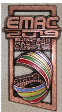
Medal for Everyone!

The pre-paid expensive 'airport to hotel' shuttle turned out to be 'airport to bus station' with a half hour walk to the hotel, BUT this was balanced with the advantage that the Registration tent was next to the bus station so I was conveniently able to register and declare for my three events. Everyone felt like a winner at that stage. Perhaps that was why each athlete received a heavy non-competitive medal with their programme (Technical Manual) depicting the Rialto Bridge with the word 'Finisher' strangely appearing on the back! The Rialto Bridge also appeared on the competition medals, although the event was not actually in Venice!