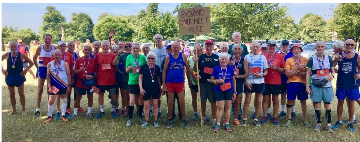
Some of the 38 Octogenarians who enjoyed the Bushy Park Parkrun in 2018

If you are over 80 make a note in your diary now – 6 th July 2019 – and be sure of being in Bushy Park to join in the third edition of the Annual Octogenarian Parkrun Celebration day. 15 runners aged over 80 completed this 5Km run in 2017, 38 were there last year, and you will be very welcome to come along to swell the numbers towards a hundred in 2019. There are over 152 men and women aged over 80, 85 or 90 in the Power of 10 rankings lists so we are expecting many more of you this year.