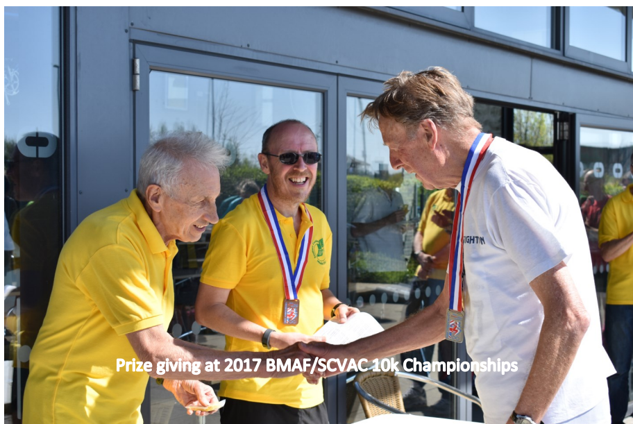
Prize giving at 2017 BMAF/SCVAC 10k Championships